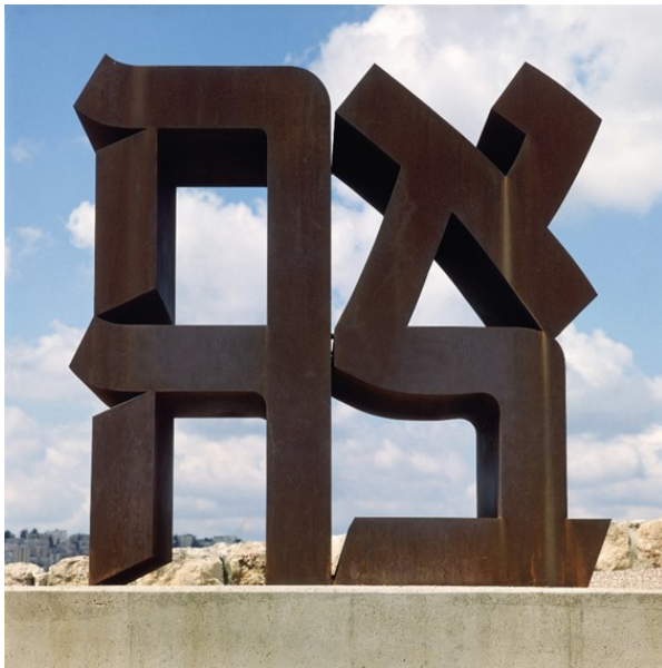
Artwork: © Morgan Art Foundation Ltd./Artists Rights Society (ARS), NY

https://www.robertindiana.com/artworks/artworks-items/ahava