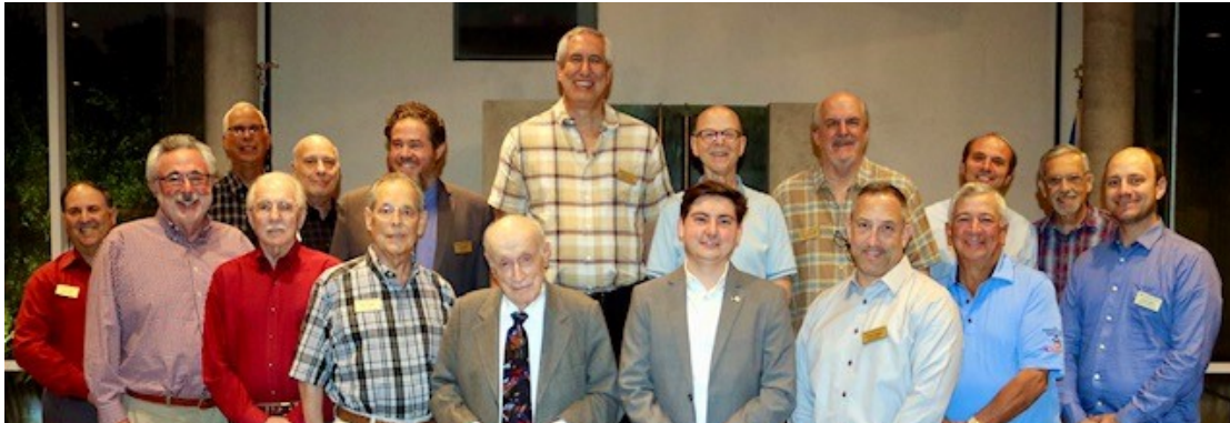
Temple Shalom Brotherhood Officers and Board - Fiscal Year 2024-2025