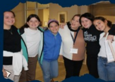
to our Opening Day of Religious School 55 years later