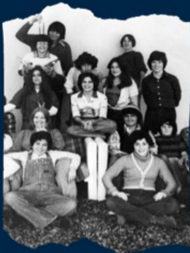
From our first youth group in 1965