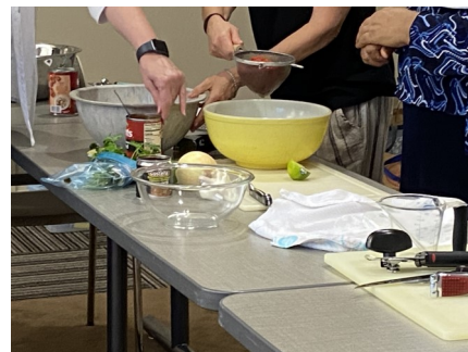
Learners & teachers making salsa together.