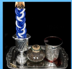
Havdalah service – reflect on the sacred nature of the day & together say farewell to Shabbat outside on the Temple Shalom lawn

RSVP by 4/20 to https://templeshalomdallas.org/family-shabbat-experience/