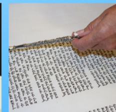
Shabbat morning – study the weekly Torah portion, family activities & worship outside in the Temple Shalom picnic area