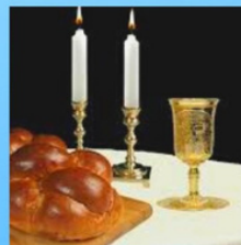
Friday night – Shabbat Service welcome Shabbat, bring a picnic style Shabbat dinner & join in worship services outside in the Temple Shalom Picnic Area.

Remember: No In-person or Online religious school or Hebrew on Sunday, April 25th