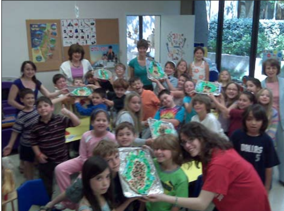
In celebration of Yom Ha'Atzmaut, our Second Graders made cookies in the shape of the map of Israel.