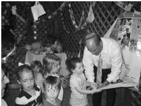
Preschoolers line up waiting to perform the mitzvah of holding the lulav and etrog

Everyone had a good time sharing dinner in the sukkah. It was a special time to dwell, to eat and to shake the lulav and etrog in the sukkah.